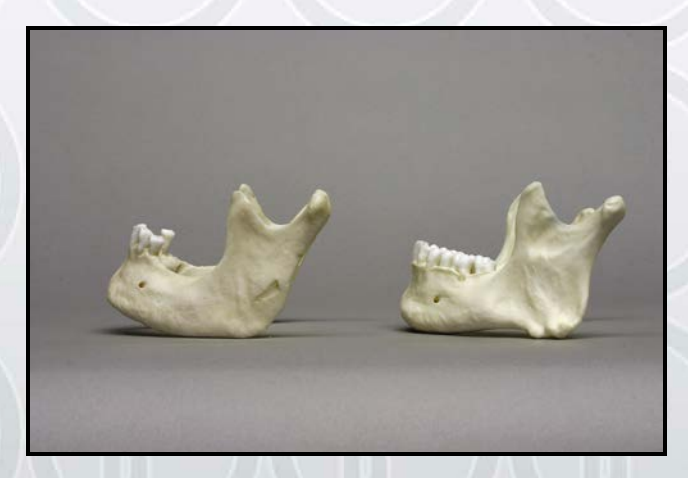
Figure 2: Comparison of Polynesian Rocker Jaw with Standard Jaw Form The jaw on the left is a "rocker jaw." The one on the right is a more standard form. Compare the curvatures of the inferior edges. (Both are male.)

The mandible is a typical "rocker jaw" as described by Philip Houghton (1977, 1978). A rocker jaw has no antegonial notch and the jaw "rocks" on a table surface rather than sitting flat on the lower edge. This type of jaw is characteristic of Polynesians.