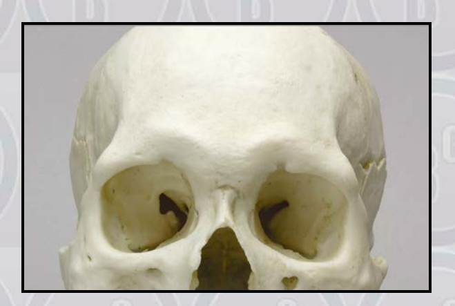
Figure 3: Closeup of "Pinched" Nasal Bones The nasal bones are narrow and meet at a sharp angle.

The nasal bones are narrow and appear "pinched" together. This form was described by Murrill (1968) as "narrow-rooted" nasal bones, typical of Polynesians.