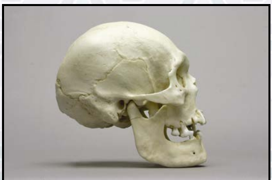
Figure 4: Lateral Views of Male Polynesian Skull Note the large masculine supraorbital ridge, the large mastoid processes, and the prominent suprameatal crest.