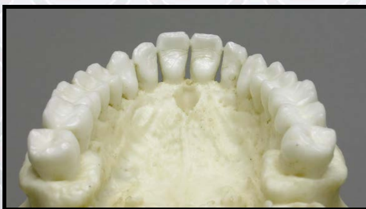
Figure 4: Maxillary dentition with good alignment, no restorations, and slightly shovel-shaped incisors

The maxillary incisors demonstrate slight “shoveling,” a trait consistent with Native American or Asian origin. The degree of shoveling, however, is not sufficiently developed to be convincing as a racial trait. (See Figure 4.)