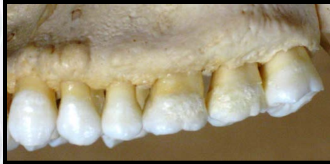
Figure 2: Periodontal disease and mild calculus deposition

The skull contains a full set of 32 permanent teeth. They appear to have been glued in place after the skull was cleaned. Overall, the teeth were in good condition at the time of death. Some calculus encrusts the maxillary molar teeth, and some reactive bone is present in the maxillary alveolar ridge (evidence of periodontal disease), but there are no obvious carious lesions. (See Figure 2.) No antemortem breaks are apparent, but several postmortem enamel chips are present (##15, 17, 30, 32). This is a common occurrence in dry specimens.