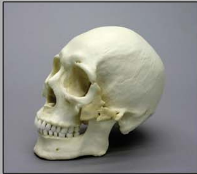
Product No. BC-303