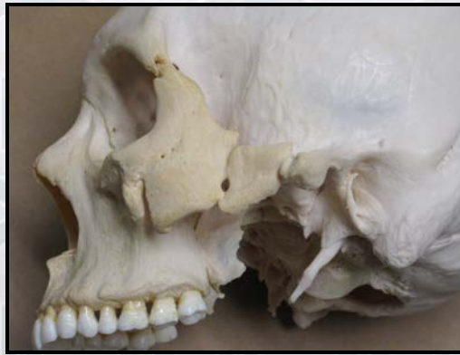
Figure 5: Fractured and healed cheek bones and styloid process

There is a healed comminuted fracture of the left cheek bones, with associated injuries to the jaw, throat, and eye orbit. It involves damage to the zygoma, zygomatic arch, temporomandibular joint, and styloid process of the temporal bone. The zygoma was broken in at least three places. The fragments were displaced medially, and healed without proper alignment. Both the zygo-frontal suture and the zygo-maxillary suture are levered open and the zygomatic arch is broken in two places and healed tenuously.