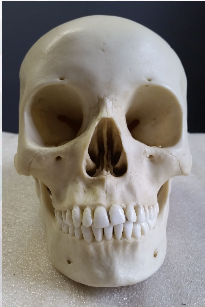
Adult Female Asian Skull