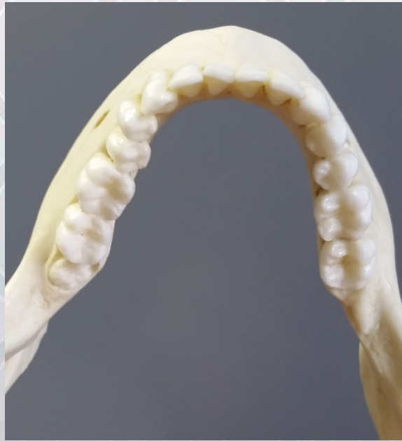
Impaction and agenesis of third molars.

There is an impacted lower left third molar, and agenesis of the lower right third molar.