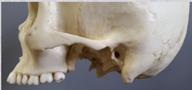
Small mastoid process.

Sex is determined most accurately by looking at traits on the pelvis and skull (Mays, 1998); the pelvis being the most reliable indicator (Buikstra and Ubelaker, 1994; Bass, 1995; Schwartz, 1995; White and Folkens, 2000). The absence of the pelvis in this case meant that determination of sex had to be made by visually scoring a variety of sexually dimorphic skeletal criteria evident in the skull. Morphological features such as the lack of robusticity of the nuchal crest, the small size of the mastoid process, the sharpness of the supraorbital margin, the lack of prominent muscle markings, and the projection of the mental eminence on the mandible suggest that this is a female (Buikstra and Ubelaker, 1994; Bass, 1995; White and Folkens, 2000).