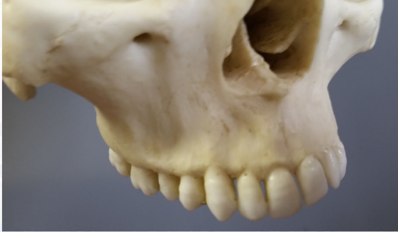
Linear enamel hypoplasias.

There is an impacted lower left third molar, and agenesis of the lower right third molar.