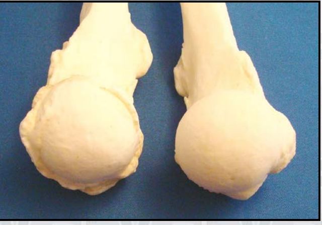
Figure 5: Right and Left Humeral Heads

The elbow joints are extremely arthritic (See Figure 6). The capitulum of the left humerus is eburnated from the effects of bone-on-bone articulation between the humerus and radius, and the movement of the ulnae on the troclea of the humeri is severely limited. Extension is not possible beyond 90 degrees, making the arms permanently bent. (Complete extension would be 180 degrees.)