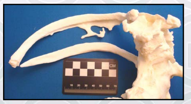
Figure 7: Kyphosis and Fusion : Seven vertebrae in the center of the back (T8-L2) are fused into a solid bony mass, producing a permanent hump back deformity ( kyphosis ). Three ribs are fused to the vertebral mass.

Within the fused section of vertebrae, three ribs are fused to the vertebral mass. The right tenth rib is missing, possibly due to its delicate condition at the time of death. Large syndesmophytes (bony growth within ligaments) are found attached to the inferior border of the ninth rib and may indicate the remains of a fractured and mostly-resorbed tenth rib.