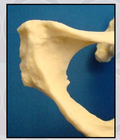
Figure 8: Female Pubis

The sacrum is fused to the right innominate (but not the left) and is unusually flat. The auricular surfaces of the sacrum are greatly reduced and sharply curved. The superior surface of S1 is decidedly angled, resulting in an extreme anterior projection of the sacral promontory (See Figure 9).