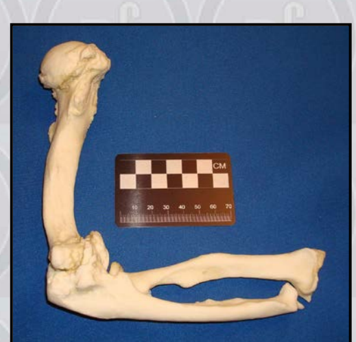
Figure 6: Reduction of Elbow Extension : The elbows are permanently flexed. Neither one extends much beyond a 90 degree angle to the humerus. This is due to buildup of osteophytic bone and closure of the olecranon fossa of the humerus.

The elbow joints are extremely arthritic (See Figure 6). The capitulum of the left humerus is eburnated from the effects of bone-on-bone articulation between the humerus and radius, and the movement of the ulnae on the troclea of the humeri is severely limited. Extension is not possible beyond 90 degrees, making the arms permanently bent. (Complete extension would be 180 degrees.)