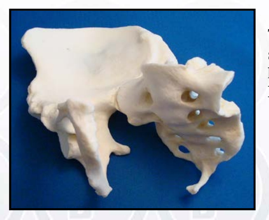
Figure 9: Flat Sacrum and Sharply Curved Coccyx

The coccygeal bones are fused to each other and to the sacrum. They are sharply curved anteriorly and would have impinged upon the pelvic floor during life (See Figure 9).