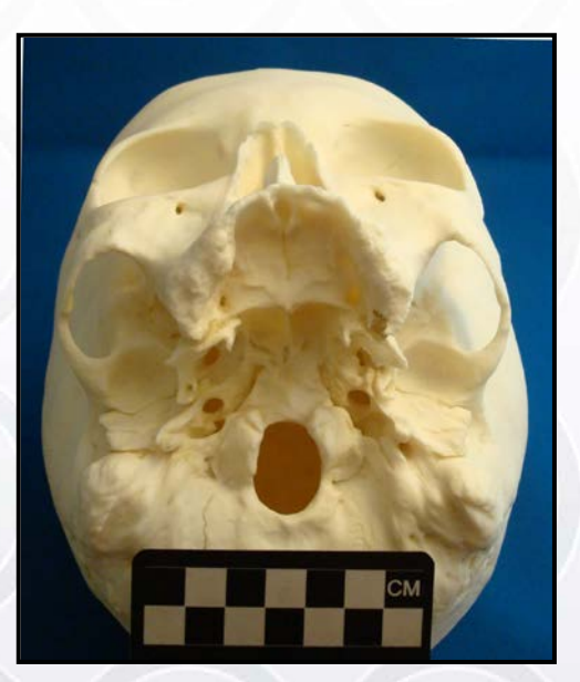
Figure 3: Foramen Magnum Stenosis