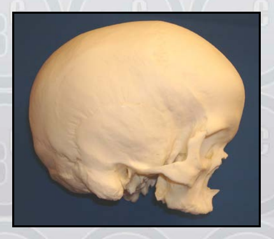
Figure 2: Lateral View of Cranium