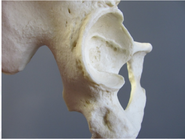
Figure 2: The greater sciatic notch is narrow, which is indicative of males.