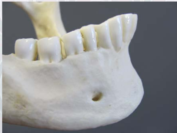
Figure 1: Right mandibular dentition with evidence of attrition and periodontal disease.

The skull exhibits full adult dentition. There is no evidence of carious lesions or dental abscessing. The right mandibular premolars and first molar show signs of wear, as does the left mandibular M1, but there is not excessive dental attrition. There is slight root exposure, which is evidence of periodontal disease.