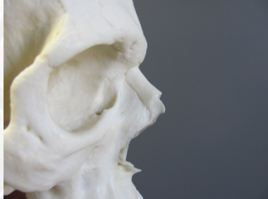
Figure 6: Depressed nasion.

Several morphological traits of the skull were used to determine the European ancestry of this individual. For example, the nasion is depressed, the nasal aperture is narrow/vertical, and there is poor dental occlusion (overbite), which are all morphological traits indicative of Europeans. An inion hook is also present, another trait occurring in males of European ancestry.