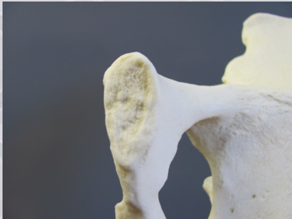
Figure 4: The pubic symphysis.

Since all of the permanent dentition was present, and epiphyseal union was complete, the skeleton was classified as an adult. Criteria such as the morphology of the pubic symphysis, cranial suture closure and analysis of the sternal rib ends were used to estimate age. Pubic symphyseal change is one of the most reliable criteria for estimating age at death in adult skeletal remains. This trait was scored for age using the Suchey-Brooks method (Brooks and Suchey, 1990), with a resulting phase 3 (21 to 46 years) determination. The degree of cranial suture closure was also used, even though there is considerable variability in closure rates (Meindl and Lovejoy, 1989). The partial obliteration of the coronal and sagittal sutures is consistent with a person in his late 20s to early 30s. While difficult to analyze on cast specimens, the costal end of the fourth rib was also observed, and seems to be consistent with Isçan's stage 3-4, which indicates a young adult (mid-20s to early 30s).