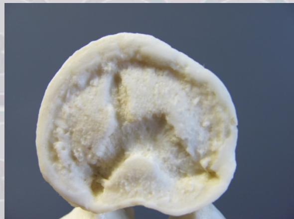
Figure 10: Schmorl's node on the inferior body of T10.