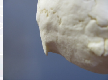
Figure 8: Inion hook.