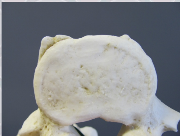
Figure 9: Osteophyte development on the superior margin of L5.

The deltoid tuberosities are quite pronounced. There is marginal osteophytic lipping on L4 and L5. There are also Schmorl's nodes present on the superior and inferior surfaces of T6 and T8, and the inferior surfaces of T7, T9, T10, and T11.