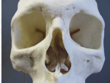
Figure 7: Narrow nasal aperture.