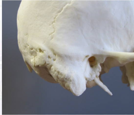
Figure 3: The mastoid process is pronounced, which is often the case in male skulls.